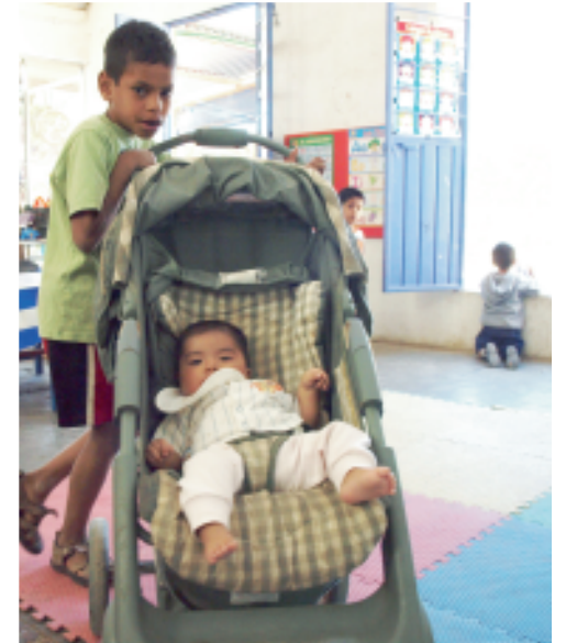
The bigger children care for the smaller ones, not because they're required to, but because they enjoy helping.

Most of the children living in the Casa Hogar were brought voluntarily by their mothers. The twins are an exception. These two three-year-old girls are physically and developmentally stunted. They were in very poor health when they arrived. Their mother was alcoholic and depressed. When she went out at night to sell her body, she would leave the twins locked in her shack. To keep them