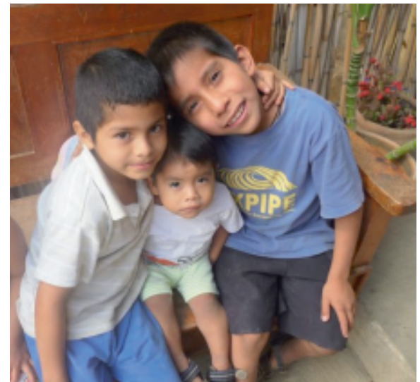
The children at the Casa Hogar, despite their stressful backgrounds, show a lot of love and caring for each other.

Moreover, too often the police also take advantage of them. Increasing the risks, condoms are seldom used: most men prefer it “flesh on flesh.” And of course, when these women get pregnant and have children, their problems multiply.