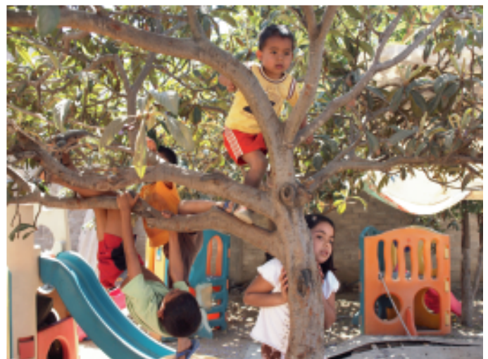
In the yard of the Shelter there are lots of playthings, slides and junglegyms. But what draws the children most are the trees, where they climb and test their skills, and develop together their own free will.

From early childhood, people are taught to feel shame for their own bodies and guilt for their desires. Their "bestial" feelings must be disciplined, or sublimated, for them to become responsible and caring members of a civilized society. From this perspective, life is an endless treadmill where we strive to overcome the evil in ourselves and others. A sense of self as a low and worthless being is inculcated from the day we're born. This demeaning self image may account for our predominant culture of domination, aggression, acquisitiveness, and violence. With the escalation of exploitive technology, this impulse toward domination rather than cooperation has put life on our planet in danger.