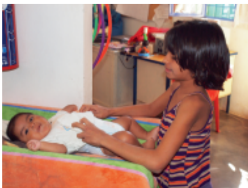
A young girl changes the diapers of a recent arrival at the Shelter.