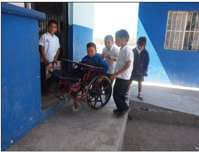
And here they help him over the door-stoop (which still doesn't have a ramp, but is not a major barrier).