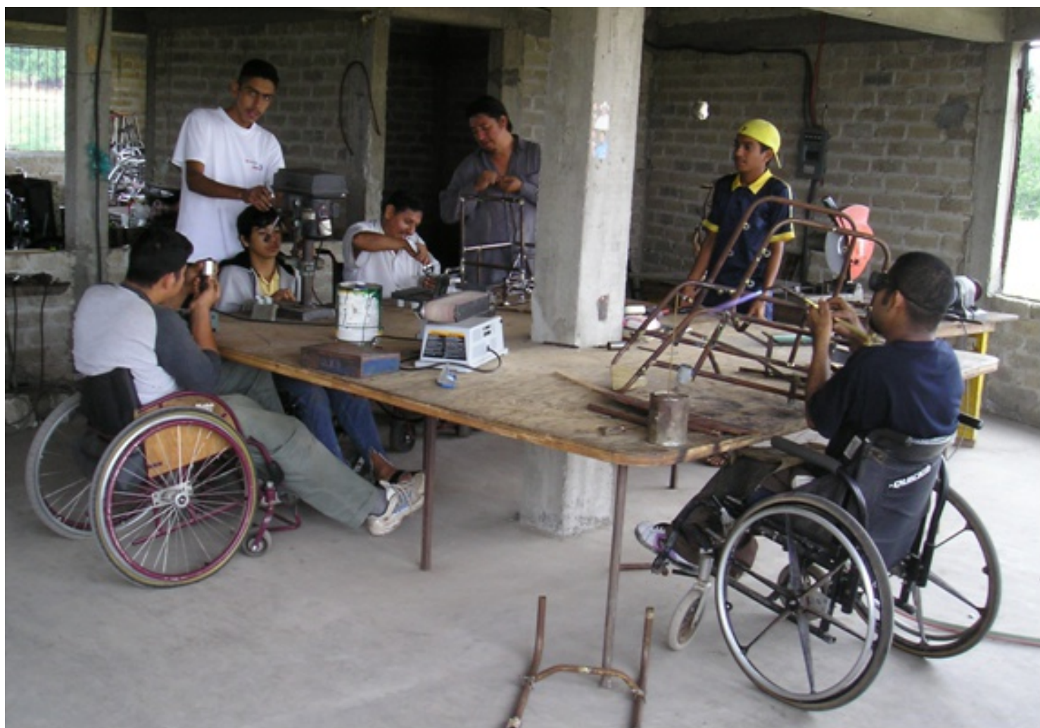
The team of disabled workers at PROJIMO Duranguito make custom-designed wheelchairs for disabled children.

(Click here to read and see more about PROJIMO Duranguito on this website.)