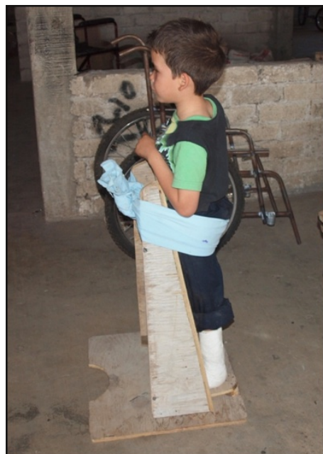
The frame not only helps him get used to standing, but the firm pelvic band helps to further straighten his hip contractures. It is important that the pelvic band be low across the buttocks, and not around the waist. That way it helps stretch the tight flexion contractures of his hips, and reduces sway-back when standing.