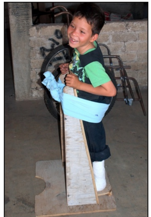
At last the boy is standing ...