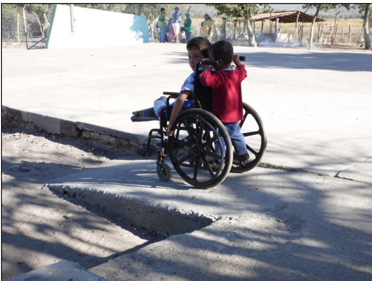
And here his chauffer gives him a ride down the ramp.