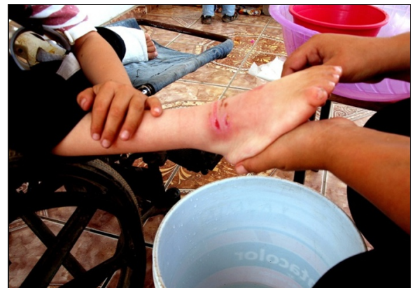
The sores didn't hurt because the child had no feeling in his feet. Fortunately the sores were superficial, but casting had to be suspended until they healed.