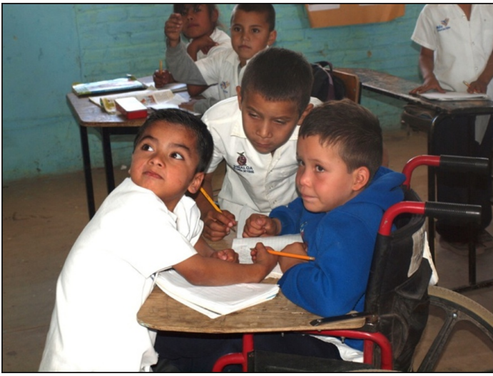
Here they help him copy in his notebook what the teacher wrote on the blackboard.