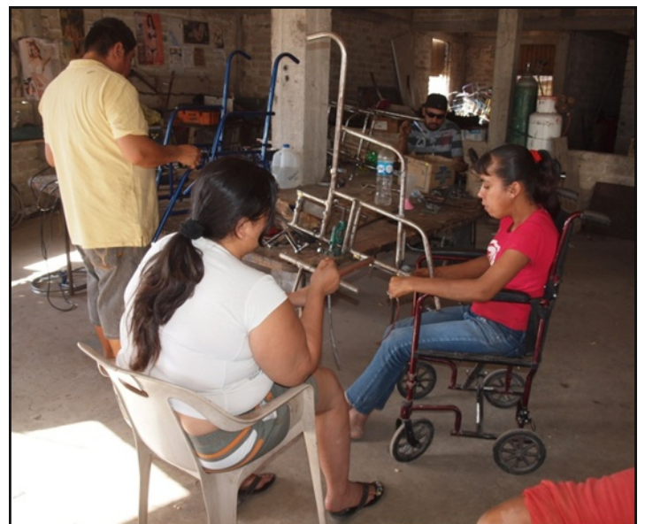
This sanding is a time-consuming chore and everyone's help is appreciated.