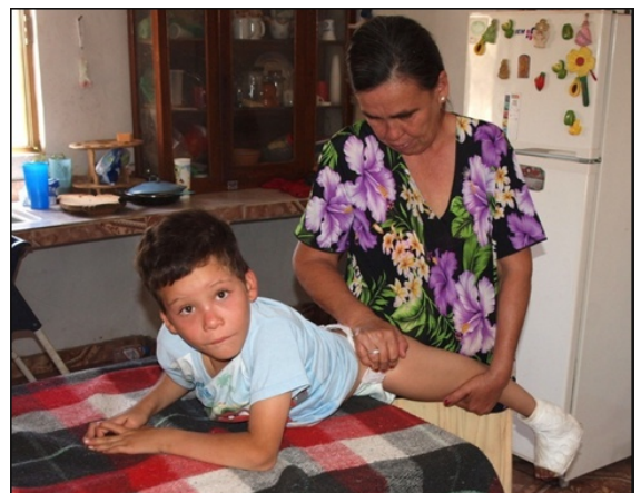
And here grandma practices the exercise. (Her technique still needs improvement.)