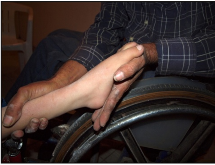
This was the position BEFORE CASTING .