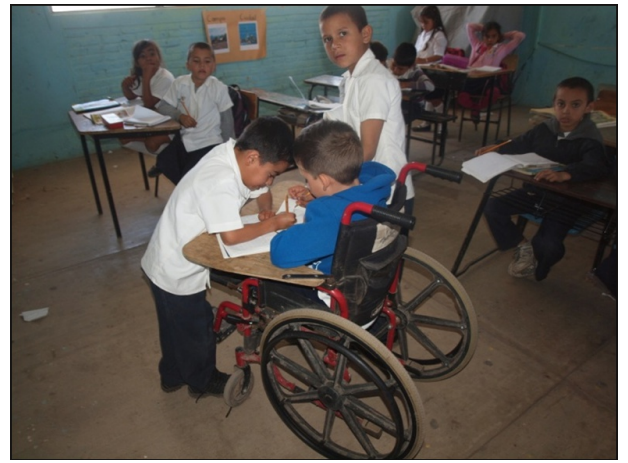
The teacher encourages and praises the children for the assistance and camaraderie they give to their new classmate.