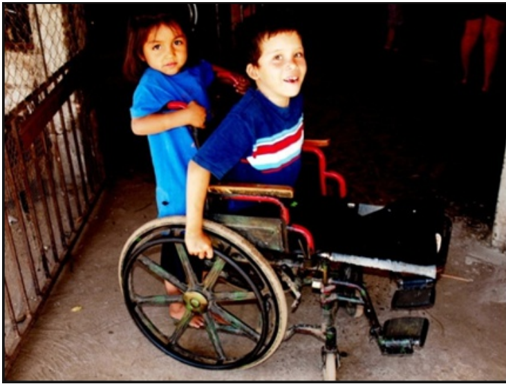
Taxi service! Giving his niece a ride.

This "taxi service" serves as good exercise for strengthening his arms. If the boy is going to learn to walk with crutches, he will need strong arms.