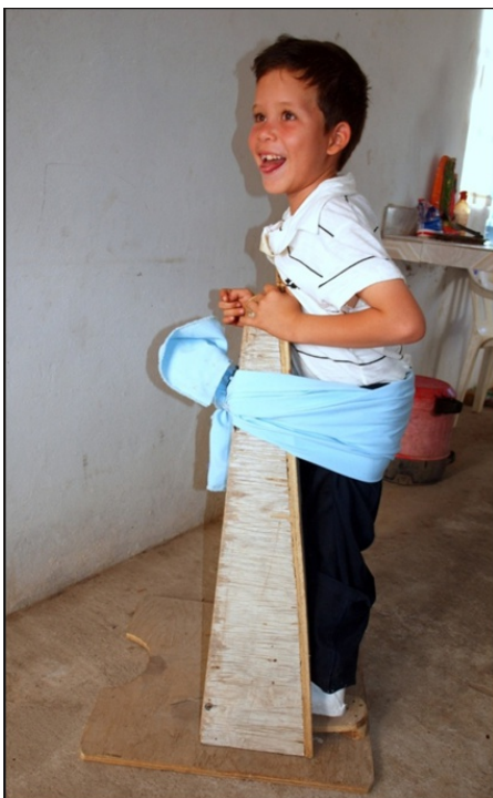
And is delighted to do so.