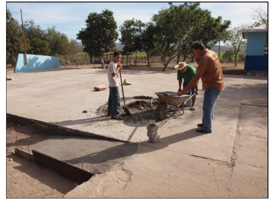
The school provided cement and other materials, and parents, teachers and older pupils provided the labor.