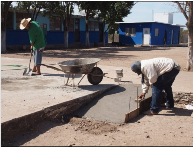
To make the play-area and classroom wheelchair accessible, the rehab team and school staff organized a volunteer town project to build the necessary ramps.