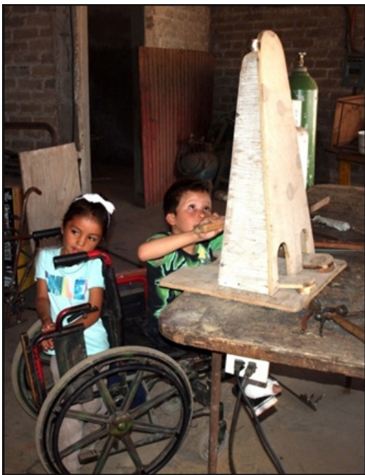
while his niece helps stabilize his wheelchair.