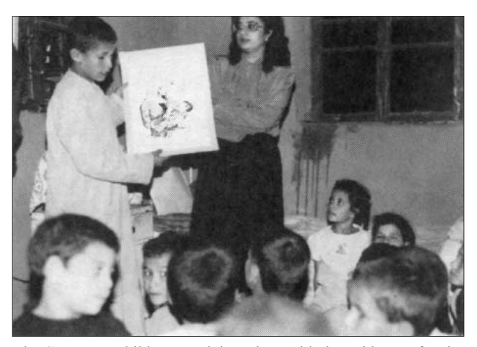
The CHILD-to-child approach in action. With the guidance of a visiting Egyptian doctor, a village boy helps classmates learn about the importance of breastfeeding and of introducing supplementary foods at four to six months of age.

Another exciting component of the village project was a "CHILD-to-child" program. The young doctors had established a relaxed and friendly relationship with the village children. A group of children met twice a week in the evenings and took turns teaching each other under the doctors' guidance about the health needs of their younger brothers and sisters. On my second visit to the village (I played hooky from the regional training program in order to go) I led a session teaching the children—and the young doctors—about dehydration and rehydration using a `gourd baby'. The response of the children to this hands-on process of `discovery-based learning' was overwhelmingly enthusiastic. What a refreshing change after days of overly structured adult meetings!