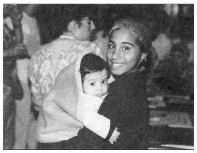
In Egypt, as in other underdeveloped countries, the main care providers for children are often their older sisters. This is why CHILD-to-child activities—which train older children to help meet the health needs of their younger brothers and sisters—are so important.

Using the liberating methodology of Paulo Freire, they started by focusing on a few 'key words' that are critical to the well-being of women and children, such as 'mother', 'breastfeeding', 'water', and 'food'. The key words became themes of discussion, not only for promoting literacy, but also for increasing social awareness and teaching health skills. As the young women gained confidence in expressing their ideas and concerns, they gradually showed more interest in becoming health workers. (Tellingly, the villagers may have had a truer sense of their health-related needs than the doctors. Studies in many countries have shown a strong correlation between 'female literacy' and a drop in child mortality.)