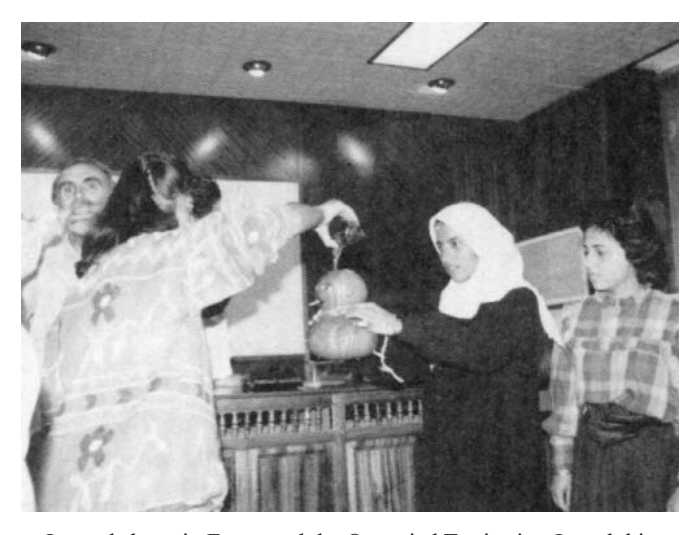
In workshops in Egypt and the Occupied Territories, I used this 'gourd baby' to help health workers learn how to teach families to use oral rehydration therapy in managing diarrhea—the world's biggest killer of children.

The fundamentalists are in part a positive force because they are critical of the government and are striving for radical change. But they are also a negative force, since their vision of the 'new society' resembles that of Iran under the Ayatollah Khomeini.