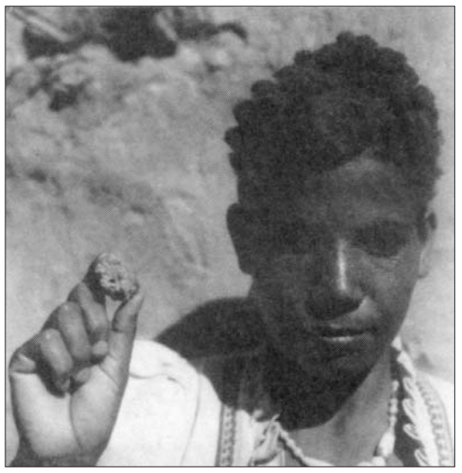
Village health worker in Beni Suet holds a piece of kishk neshif – possibly the most appropriate local basis for oral rehydration therapy.

Another Egyptian home remedy for diarrhea presents an even more exciting possibility. I learned about this while visiting a small, nongovernmental health and development program in Beni Suef, in the relatively disadvantaged east bank area of the Nile. When a village health worker told me that children often dislike the taste of ORS and refuse to drink it, I asked her what she gives them instead. She said she asks mothers to prepare a drink made with kishk neshif .