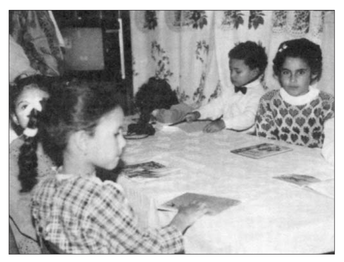
Because their families cannot afford to pay for the private tutoring sessions necessary to pass exams, most poor children drop out and illiteracy rates remain high, especially for girls.

I was told that one of every five Egyptians is in some way part of the security network, either as a member of the army, the police, or the secret police, or as a guard or informer. Others have told me that this is an exaggeration, but agree that the security system is immense and all-pervasive.