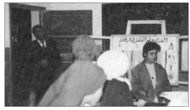
Security police stand in the doorway of a village school where an adult literacy course organized with the help of medical students is taking place.

The campaign has taught Egyptian mothers about ORS through health centers, schools, and a blitz of one-minute television spots. This form of 'social marketing' through