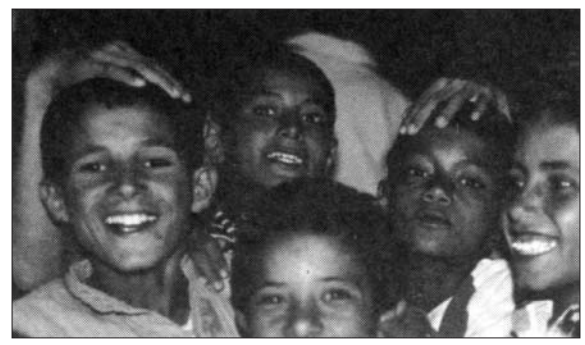
In spite of the severity of conditions in Egypt, the spirit of these village children remains unquenchable.