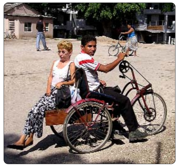
With this hand-powered "bici-taxi" a disabled man gives a ride to a disabled woman. (She said she was not afraid of falling.)

reassignment of dwelling would be difficult. But in Cuba, with the close link between the CBR team and the cooperating network of service organizations, it could be possible. And it would fit into the broad range of activities the Activistas tend to take on.