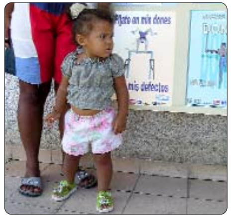
Many of the disability awareness-raising posters are adapted from the books that grew out of PROJIMO in Mexico, such as this one that says "look at my strengths, not my weaknesses."

As with many CBR programs, the social aspects of the pilot project in Cuba tend to be the strongest, while the technical or therapeutic aspects are weaker. The Cuban Project conducts many innovative "sensibilización" activities in the villages to raise people's awareness about disability. The emphasis is on fuller inclusion and equal opportunities. I was delighted to see that many of the colorful posters displayed in schools and public buildings are based on illustrations from my books.