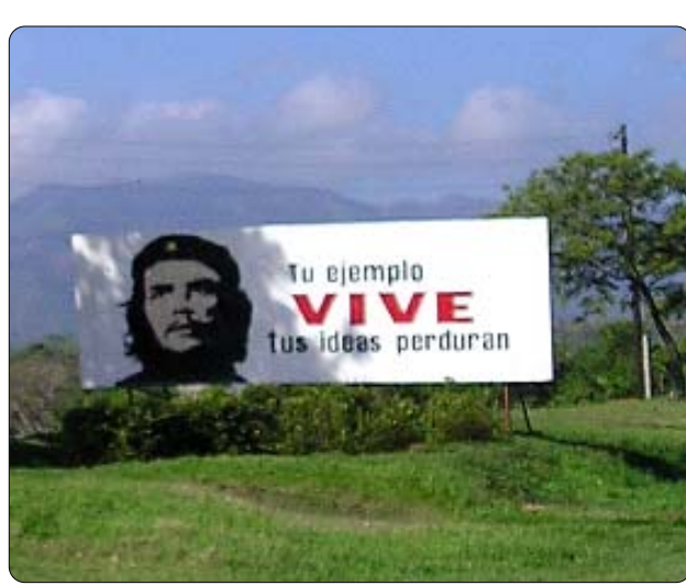
Billboards on Cuban highways don't promote Coca Cola or other corporate products. They promote the social ideals of the Revolution.

Everyone agreed that in addition to bringing mental retardation into the scope of their rehabilitation activities, they urgently needed more training, more instructional material, and more skilled backup to respond to the needs of children with cerebral palsy.