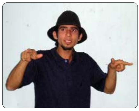
This young man, who has a paralyzed leg, gives a "rap" performance at the CBR headquarters in Bartolomé Maso. There they accompany their speech and song with sign language so as to include persons who are deaf.

However, many possibilities for Child-to-Child exist. Cuba has a program called "Jornadas de Interés." Schoolchildren are given an opportunity to apprentice with adults working in the vocation they aspire to: be it medicine, nursing, agronomy, police work, teaching, automotive mechanics, or carpentry. So why not for the deaf? Cuban children are exposed to sign language on television programs, many of which include a corner image of someone signing. If Cuban schools were to include a brief introduction to sign language, as in Los Gigantes, those children who show interest could apprentice with an interpreter. They could then serve as "junior interpreters" for deaf children in the classroom—as well as teach signing to the other children.