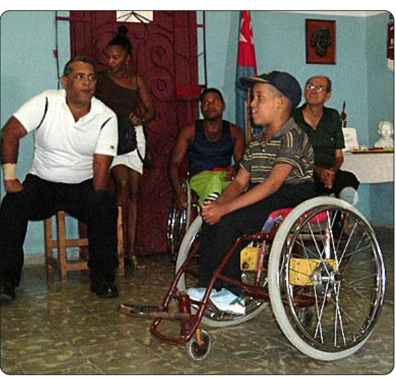
This boy with spina bifida, a member of the Association of the Physically Disabled Persons, sings for the closing Evaluation Seminar of the CBR Project. He sings beautifully, and again impresses people with his strengths, not his weaknesses.

Nobody in Granma seemed to have statistics on CP. On my last day, a visiting health