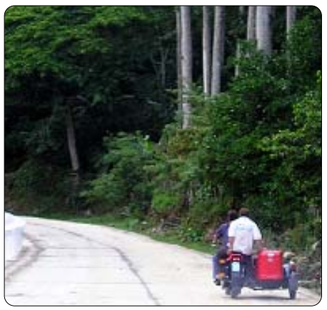
Trainers and instructors travel deep into the Sierra Maestra to provide backup for the Activistas.

A third outstanding feature of the Cuban CBR project—again distinguishing it from others—is the strong active involvement of an entire network of official health and welfare services, especially at the community level. I was impressed how well the representatives from different service sectors cooperate with their disabled colleagues in the Associations of Disabled Persons. This interaction is aided by the fact that many Activistas, some disabled themselves, hold positions in government services at the community level: as teachers, nurses, special educators, family counselors, and members of women's, youth or farmworkers' associations. This gives them close ties with a range of public services agencies, which they can call for backup or referral when needed. Consequently, the multisectoral support system, which is often a weak point in many CBR programs, works refreshingly well in Cuba.