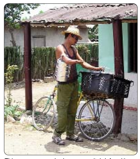
This young man, who has congenital deformities of both upper limbs and one leg, works delivering cooked meals every day to more than 20 disabled persons who are not able to come to the comedor.

However, many possibilities for Child-to-Child exist. Cuba has a program called "Jornadas de Interés." Schoolchildren are given an opportunity to apprentice with adults working in the vocation they aspire to: be it medicine, nursing, agronomy, police work, teaching, automotive mechanics, or carpentry. So why not for the deaf? Cuban children are exposed to sign language on television programs, many of which include a corner image of someone signing. If Cuban schools were to include a brief introduction to sign language, as in Los Gigantes, those children who show interest could apprentice with an interpreter. They could then serve as "junior interpreters" for deaf children in the classroom—as well as teach signing to the other children.