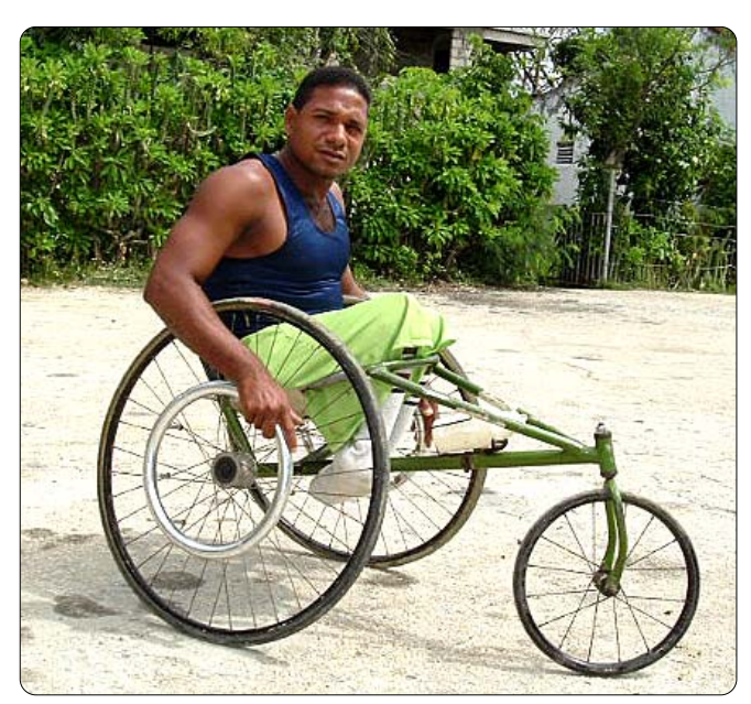
This young man, a Special Olympics athlete, has run international races. His racing wheelchair was made in the workshop of the Association of Physically Disabled Persons in Bayamo.

wide, government-approved Associations. Since these three Associations are the structure through which disabled persons play a central role in the CBR Project, it had been decided to focus on these 3 disabilities.