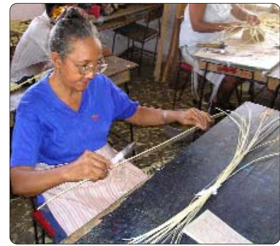
In the sheltered workshop in Bartolomé Maso, deaf persons are recovering a traditional craft of making baskets and sombreros from thin flexible strips of wood they cut from a vine that grows in the Sierra Maestra. Cuba is increasingly focusing on reviving traditional arts, as well as indigenous medicinal plants.

We also discussed the need for a more logical, analytical problem-solving approach to Activista training. discussed the need for more interchange with the families—looking for solutions together, as equals—rather than simply giving people a routine series of charlas. This give-and-take, open-ended, egalitarian approach to problem solving is important not just for the Activistas and their instructors. In a society striving for inclusion and equality—as do both CBR and the Cuban Revolution—it is important for everyone.